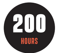
Staff time spent doing community outreach in 2018