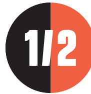
Women comprised 50% of new hires in 2018