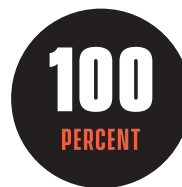
Technical specialists with top-tier safety certification