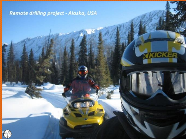
Remote drilling project - Alaska, USA