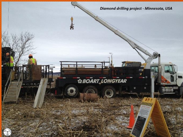
Diamond drilling project - Minnesota, USA